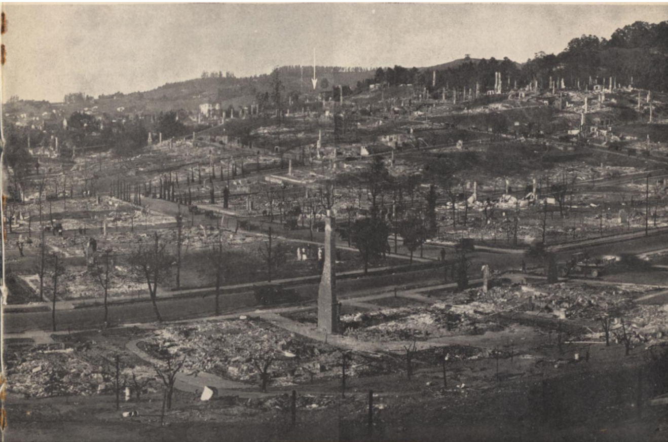
PANORAMIC VIEW OF THE BERKELEY FIRE