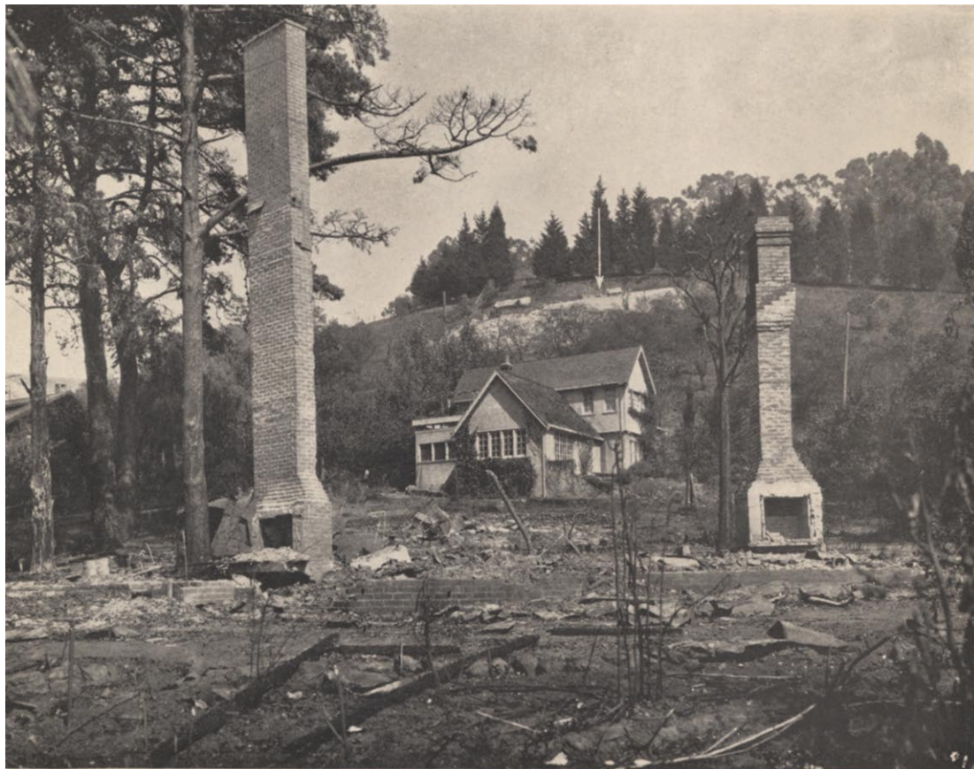
Greenwood Terrace, near Buena Vista Way, looking east.

The arrow indicates a stucco and concrete house that was completely destroyed. The wind blew directly across the shingle roof home that was saved, but it remains as good as it ever was. Fire ran through the shrubbery, the garden was ruined, and the ivy on the side of the house was killed by the heat. Despite this fiery ordeal, it escaped intact.