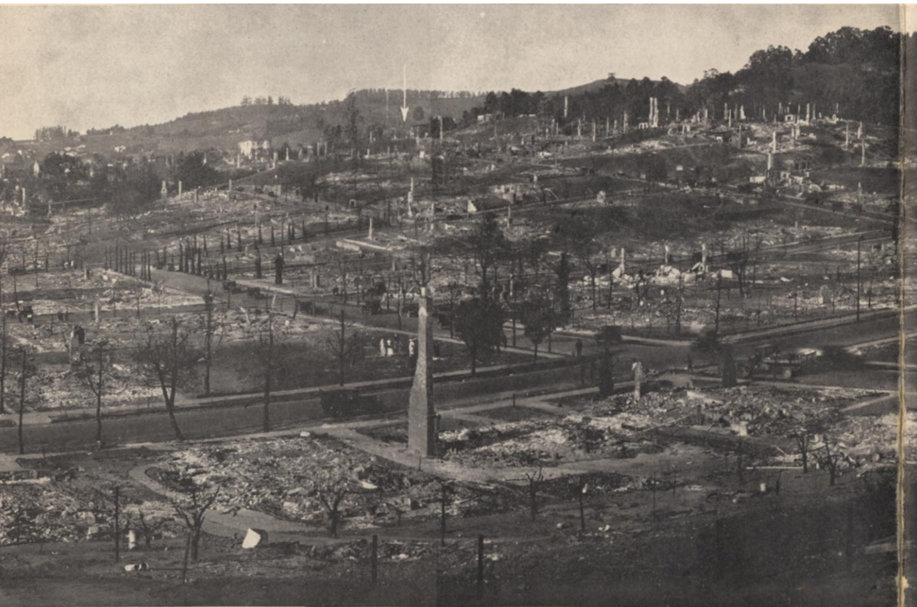
PANORAMIC VIEW OF THE BERKELEY FIRE