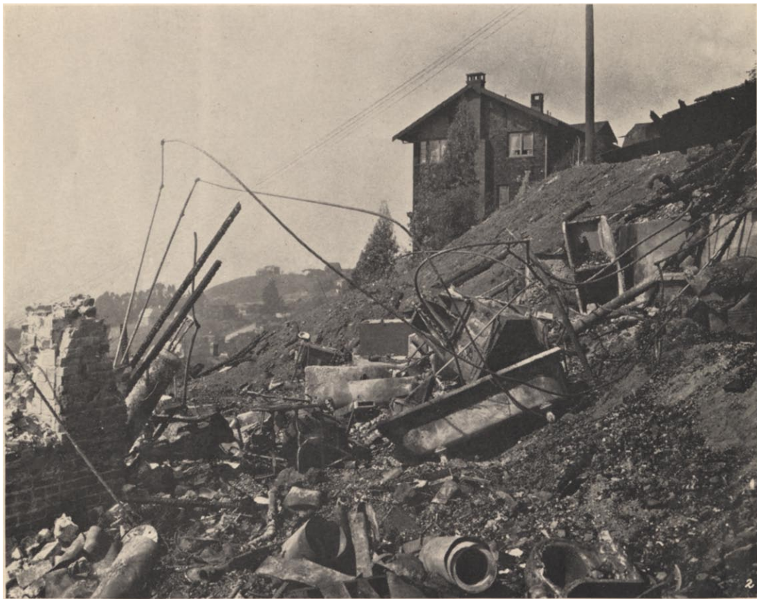
Home of Professor Tolson, University of California, on Shasta Road (at top right).

Looking Northeast—An all-shingle home directly in the path of the strong wind and adjoining first house to catch fire. This house was not surrounded by trees and suffered no damage to the roof. The side wall was partially scorched, as indicated by small amount of repair shown.