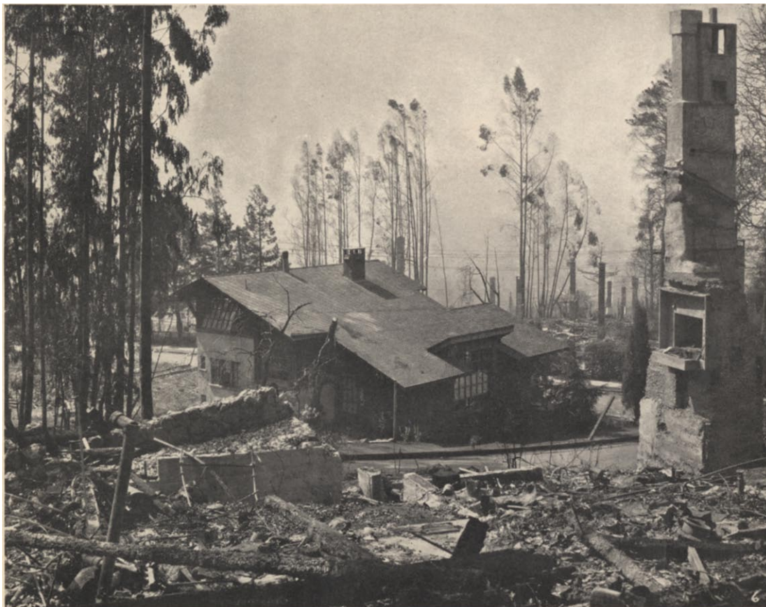
Looking southwest over the ruins of Professor Maybeck' home on Buena Vista Way.

Another example of a shingle roof house completely surrounded by fire. Note particularly the fir tree shown at the corner of roof. This tree caught fire and was chopped down while burning. Shingles were charred by burning branches and needles, but the house was saved. All surrounding shrubbery was killed by the heat of the fire.