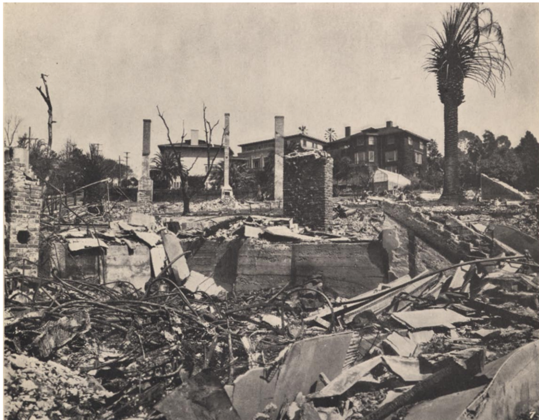
Scene on Heart [ sic ] Avenue near Scenic Avenue

This photograph shows two stucco houses and one all-shingle house. All these houses had shingle roofs. These houses, which were right in the path of the flames, were saved by a sudden change in the wind. The shingle roofs were not even scorched, despite the rain of sparks that must have fallen on them before the course of the wind changed.