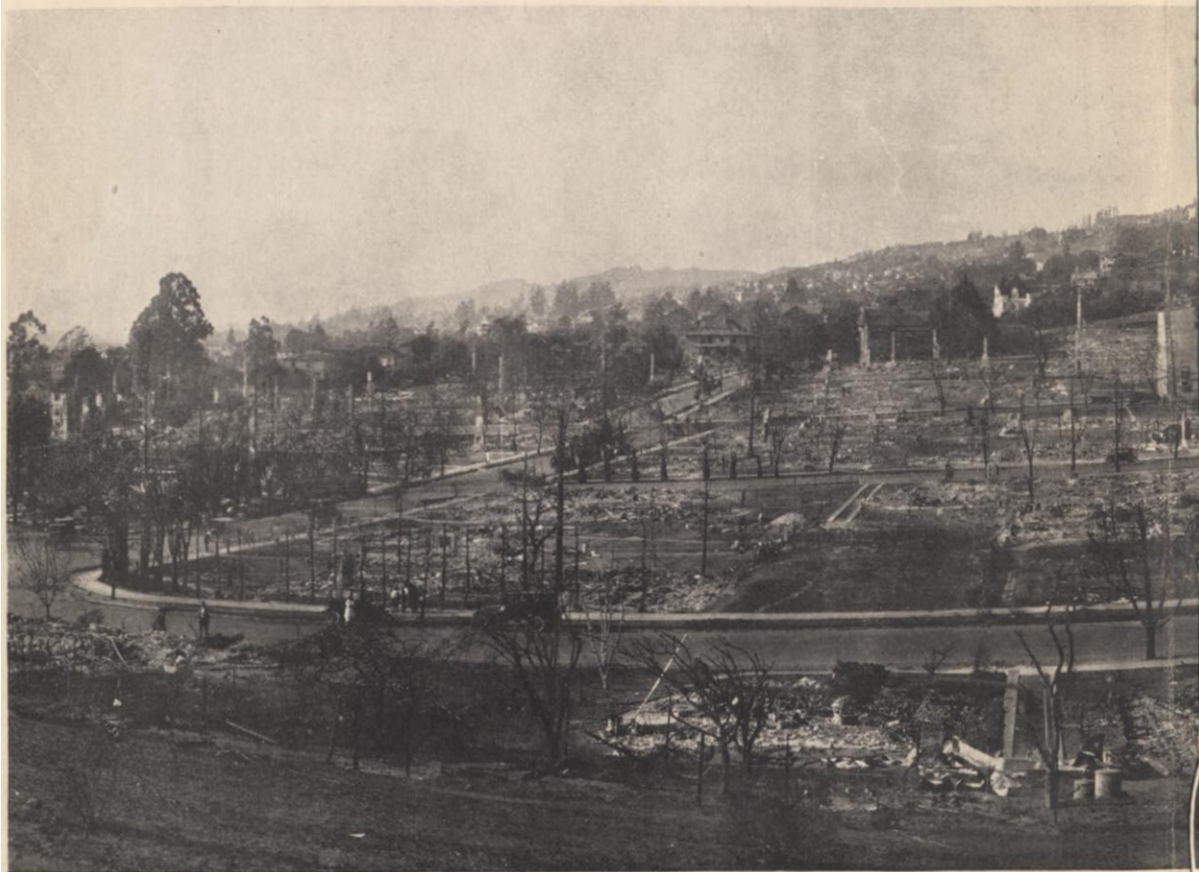
Brush and grass fires swept over hill in background. The arrow at the center, near top, points to location of first house to catch fire. (See illustration and affidavit.)