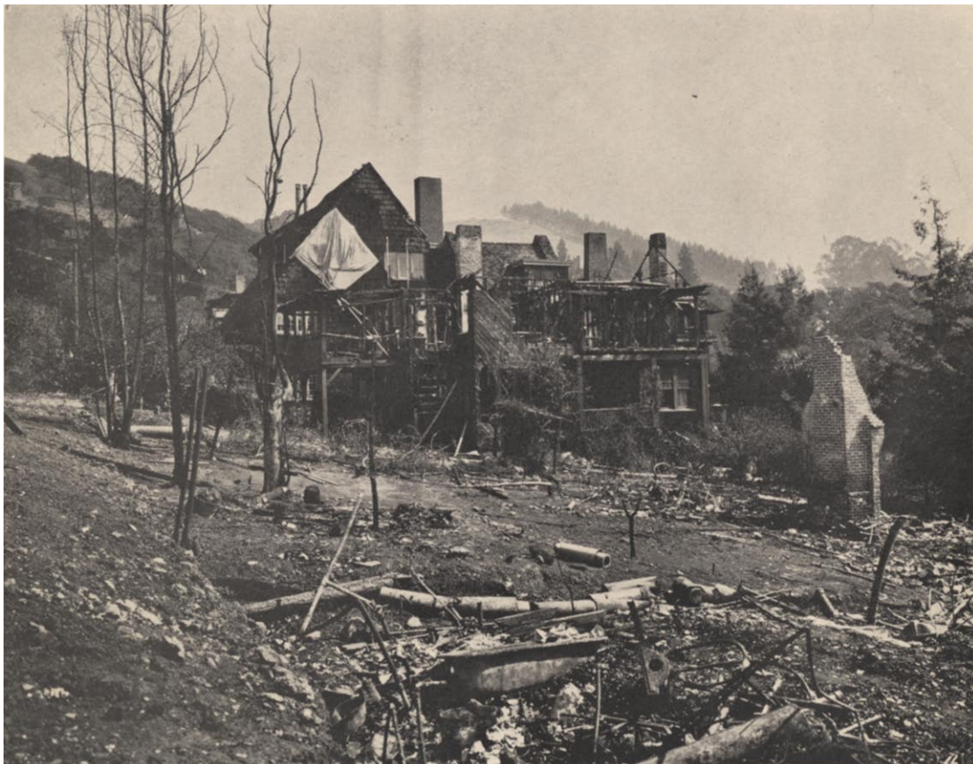
Le Conte and Le Roy Avenues

This house was on the edge of the fire and was separated from the adjoining house by only a fifteen-foot alley. The neighboring house was almost completely destroyed, while this all-shingle structure, though badly scorched, was not destroyed.