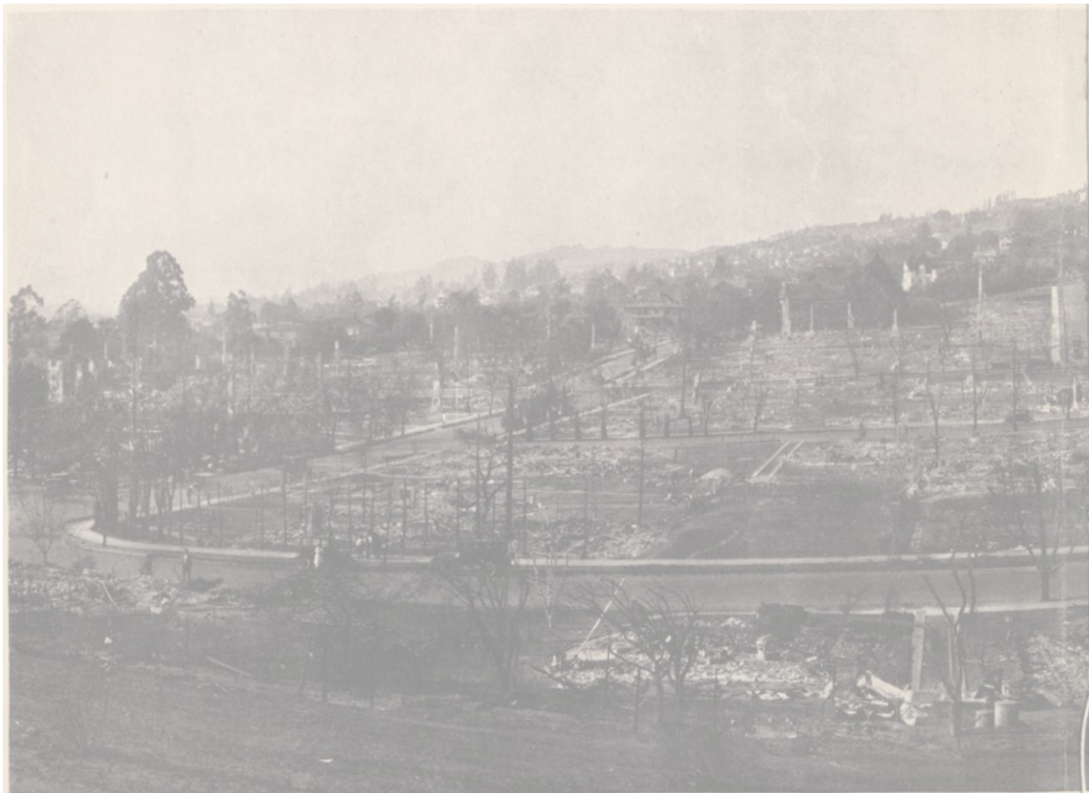
Brush and grass fires swept over hill in background. The arrow at the center, near top, points to location of first house to catch fire. (See illustration and affidavit.)